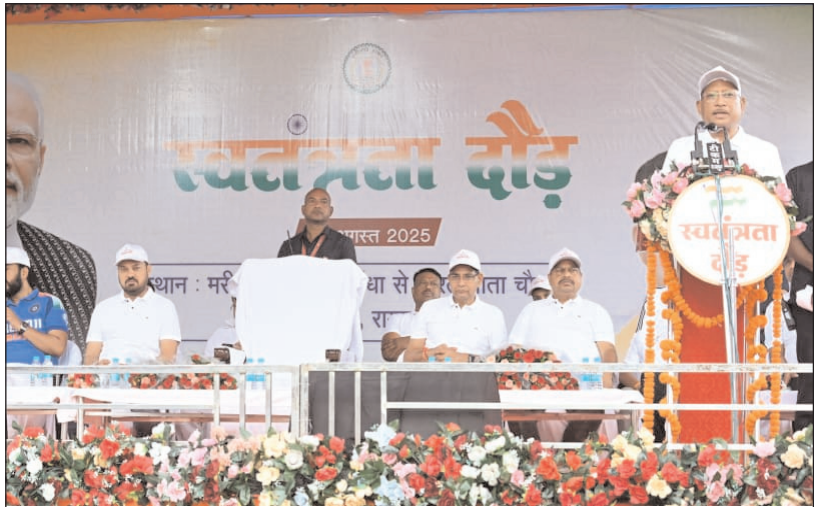
STAFF REPORTER ■ RAIPUR

“Our Tricolour is the living symbol of the years of struggles and sacrifices of our forefathers. We will always uphold its honour, never forget our immortal martyrs, and together build a developed, prosperous, and strong Chhattisgarh,” said Chief Minister Vishnu Deo Sai while addressing a gathering at the Independence Run organised at Marine Drive in the state capital on Thursday.