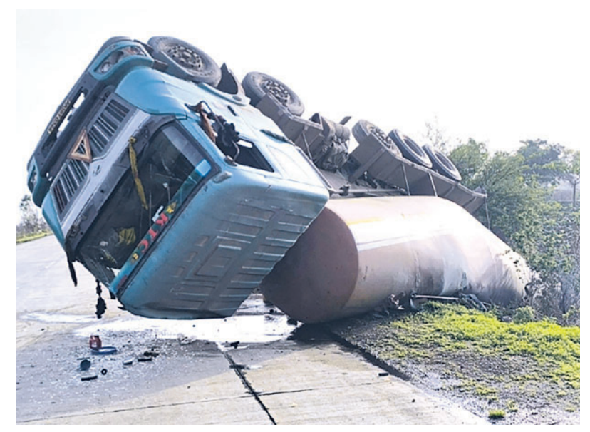
The ill-fated cement container truck that overturned on the Bhokar-Himayatnagar stretch of the Chandrapur-Nanded National Highway in the early hours of Saturday

Public demands urgent safety measures on route such as speed-breakers