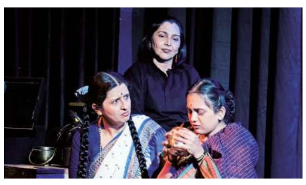
The 'Hutashani' will be held at The Box in Erandwane on April 24 and 25. Express